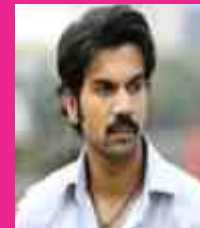
Rajkumar Rao Actor Winner of National Award & Film Fare Award