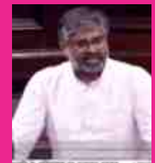
Sh. Neeraj Shekhar MP, Rajya Sabha