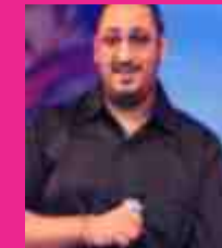
Jaspreet Jazz Bollywood and Telugu Singer