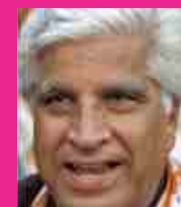
Mr. Ramakant Goswami, Ex Minister in Delhi Government