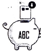
Transfer of Credits