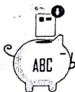
Transfer of Credits