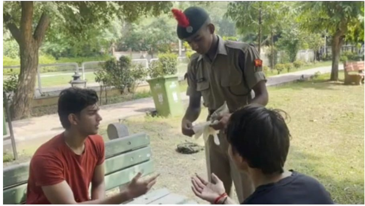
Public involvement in journey of waste management