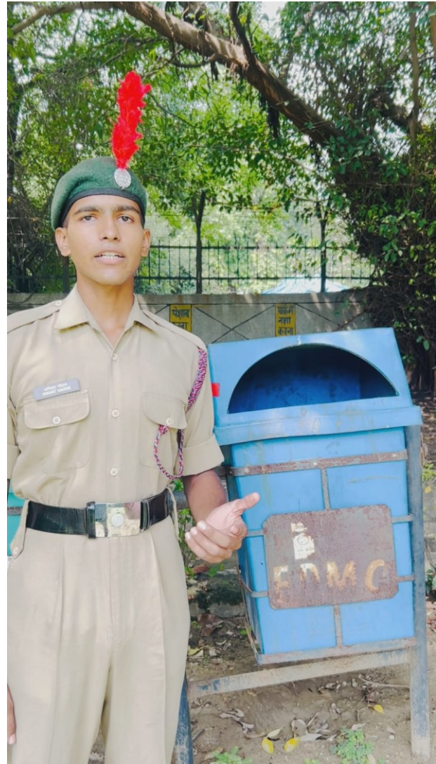
2 BIN System for Source Segregation