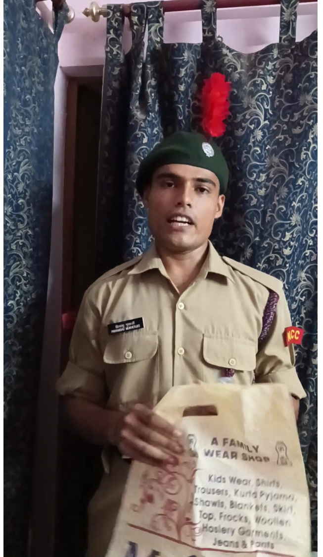
Alternatives of Single use plastic