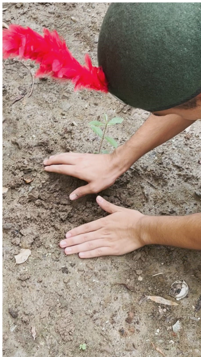
Adopting lifestyle for Environment