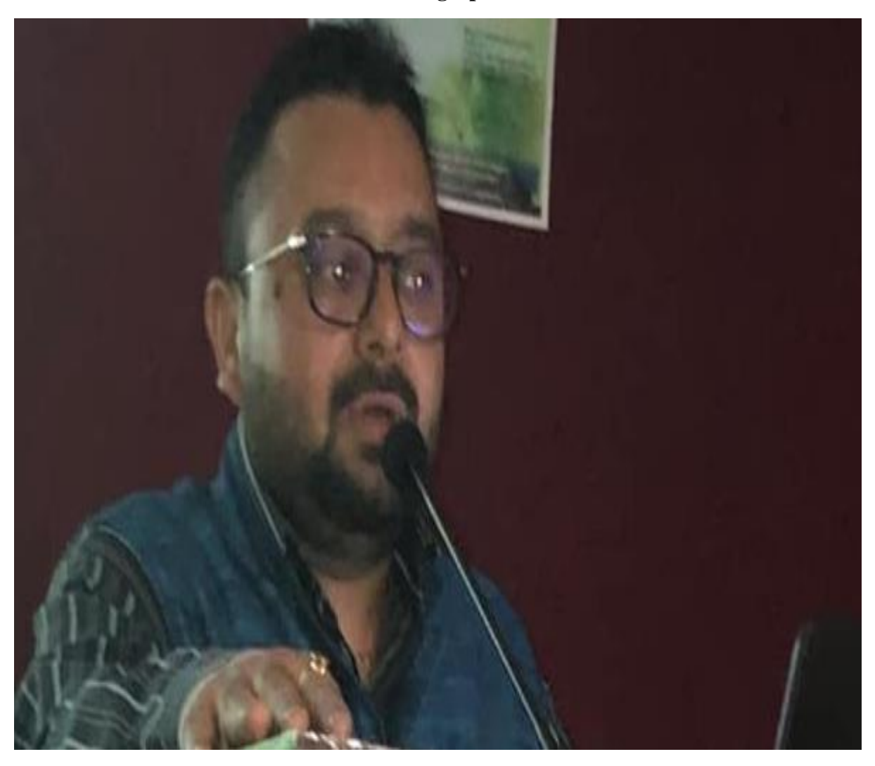
Speaker during the program